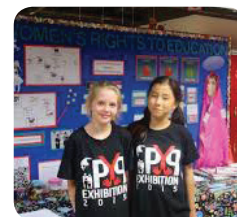
Students during the PYP Exhibition